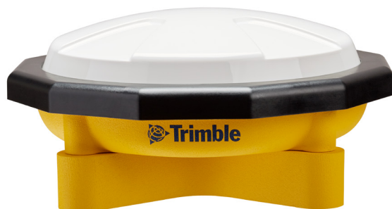
Picture 1: Zephyr 3 with 5/8" Mounting PN 125000-30-INT