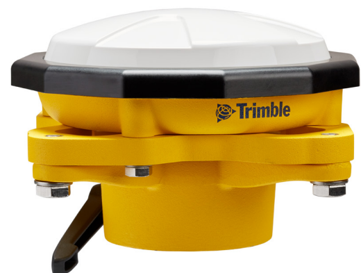
Picture 2: Zephyr 3 with 3" Mast Mounting PN 125000-10-INT